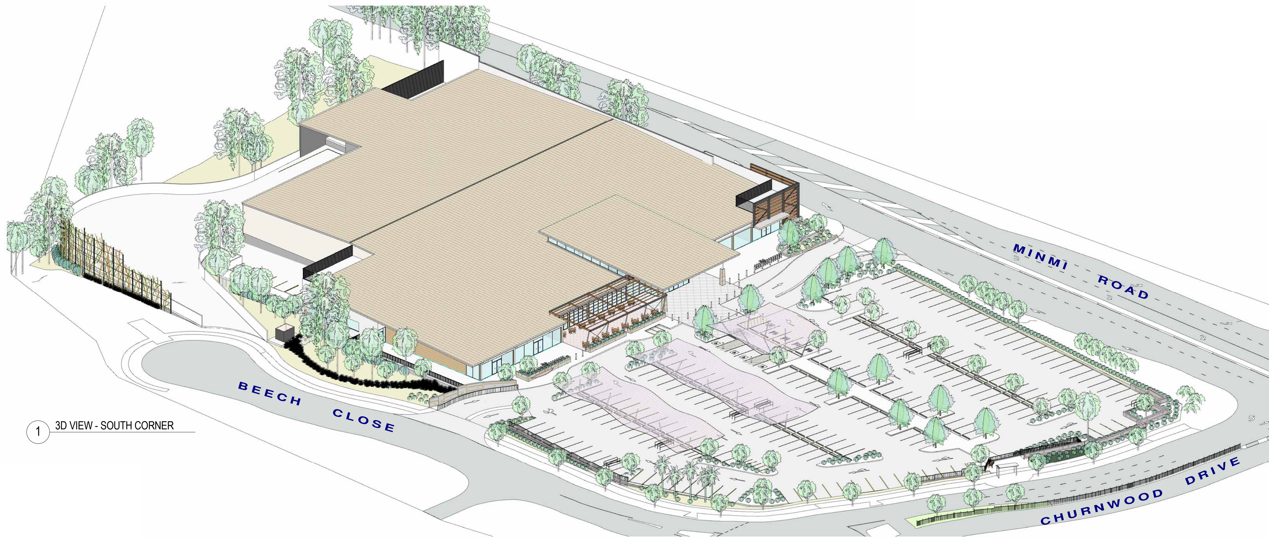
1 3D VIEW - SOUTH CORNER